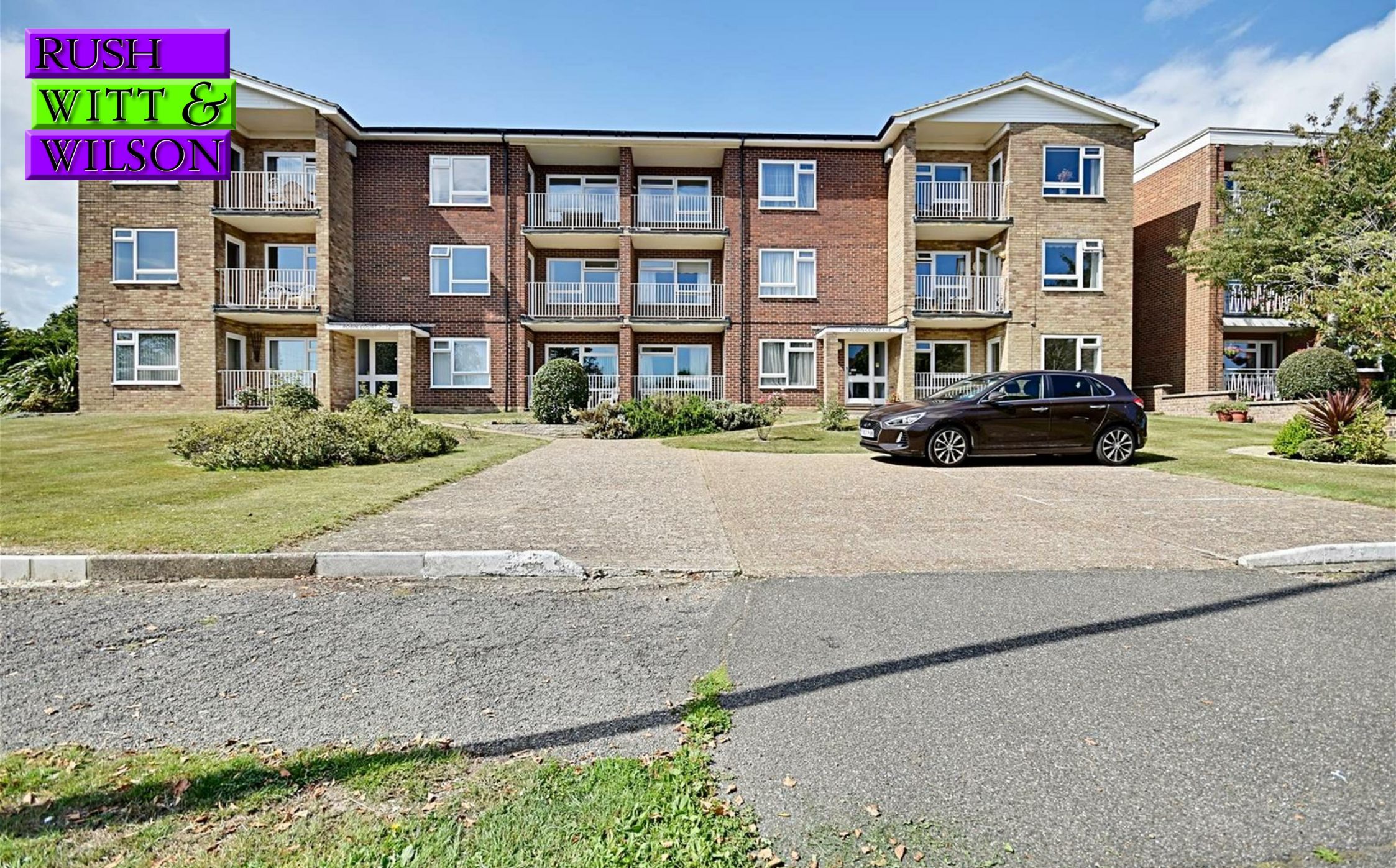
5 Robin Court Cooden Drive, Bexhill-On-Sea, East Sussex TN39 3DQ £260,000